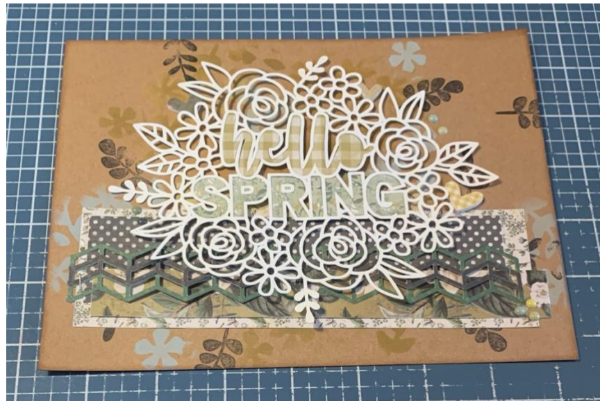
Here is the finished Hello Spring Page.