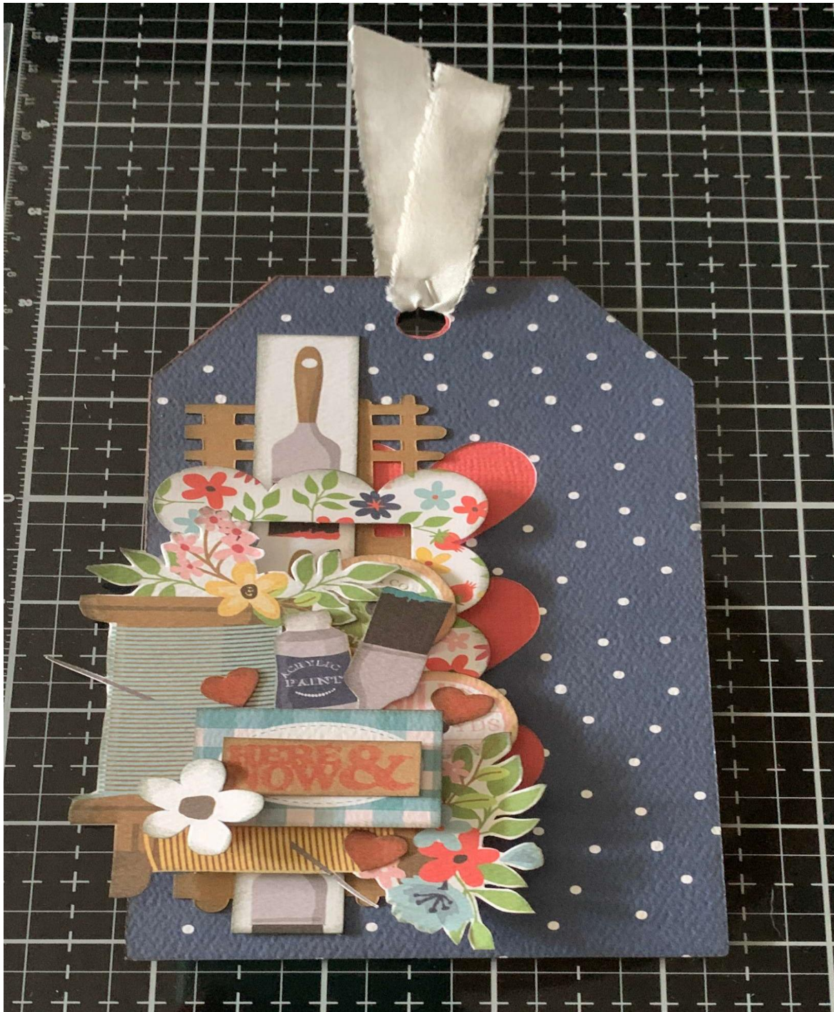
Here are the finished Here & Now and Life Captured Tags.