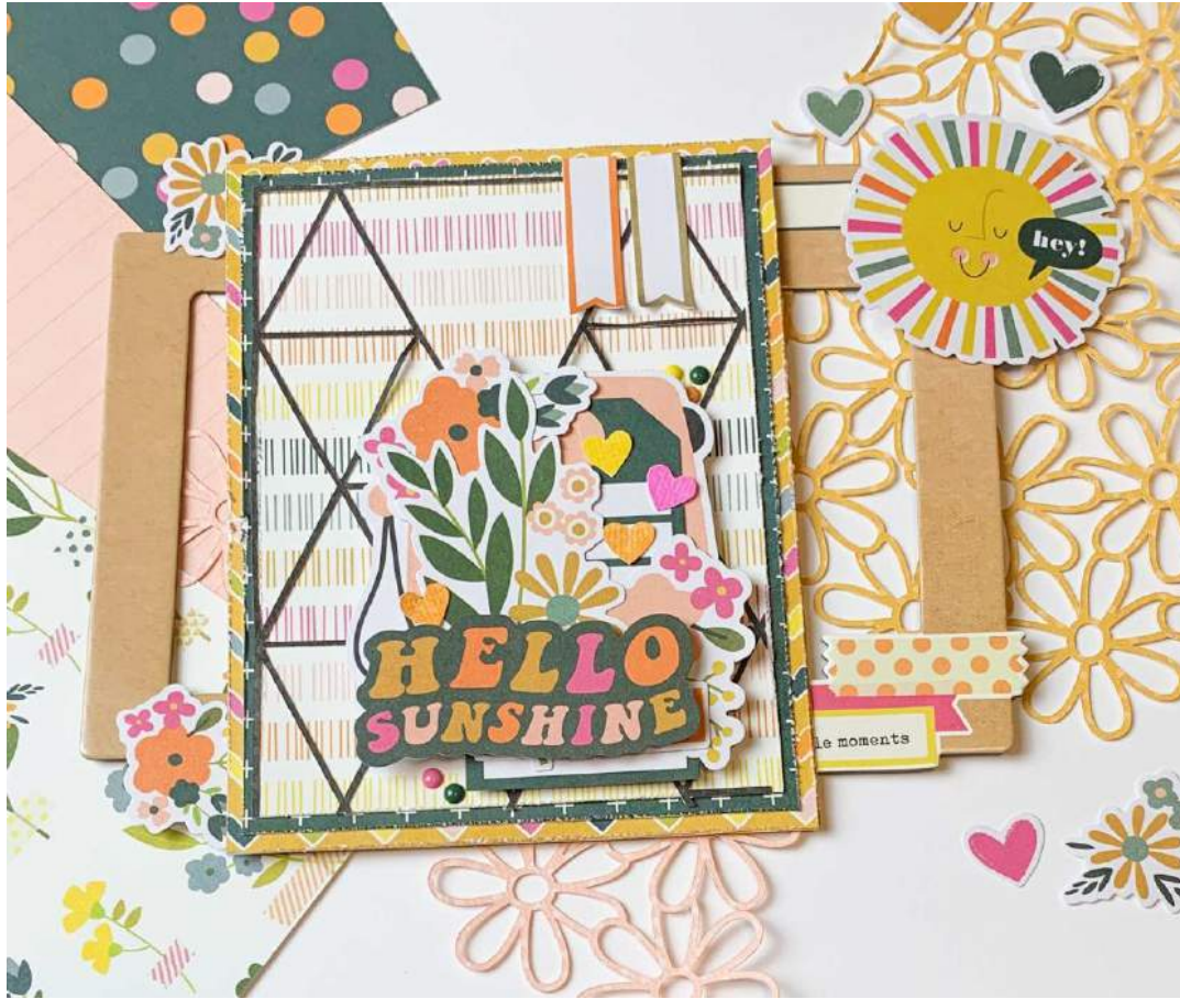
Here are the finished Hello Cards.